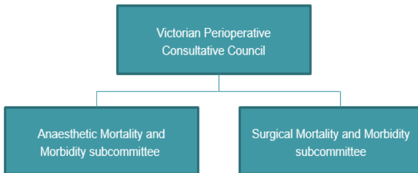
Figure 1: Proposed perioperative council structure

It is proposed that the perioperative council is established in the same manner as the obstetric and paediatric council, with an overarching council consisting of members with suitable technical and professional expertise, responsible for overseeing two substantive subcommittees. As illustrated in Figure 1, two key subcommittees will report to the perioperative council: one with a focus on anaesthesia-related mortality and morbidity and the other on surgical mortality and morbidity. A chairperson and deputy chairperson will be appointed to the overarching perioperative council, as well as to each subcommittee. Mortality and morbidity cases will be reviewed and classified by speciality clinicians on each of the subcommittees.